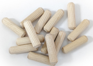
BIRCH WOOD DOWEL