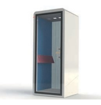
GS04PRO - Closed