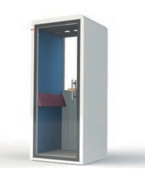
GS05PRO - Semi closed back

The Procyon Stand up range is available in two versions: