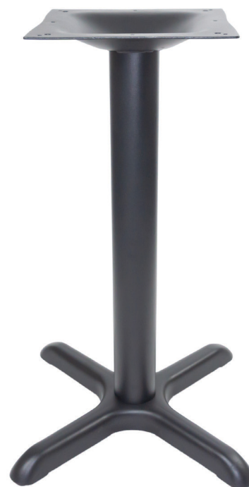
2022-BPS & LS-3-DHS