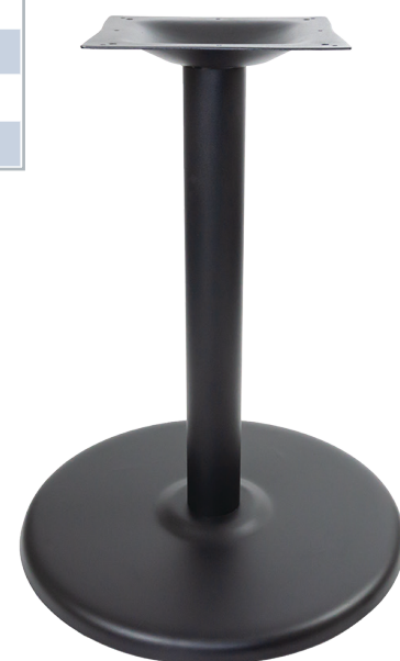
3322-BPS & LS-3-DHS