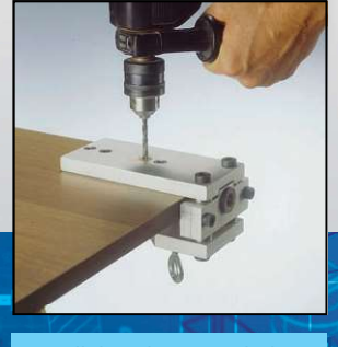
Drill the adjustment hole.