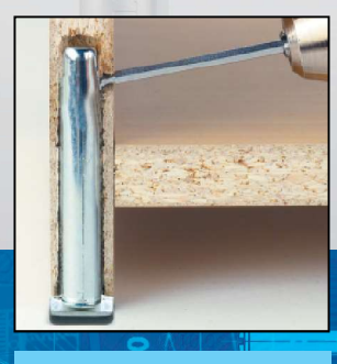
Adjust as needed through adjustment hole.

Rectangular foot provides easy alignment of the adjustment hole.