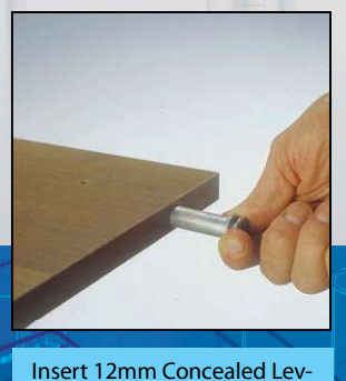
eler into placement hole.