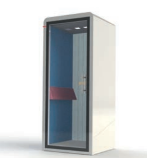
GS04PRO - Closed