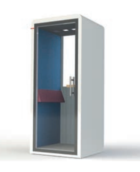
GS05PRO - Semi closed back

The Procyon Stand up range is available in two versions: